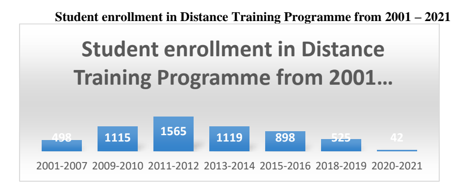
ODeL student population – March 2022